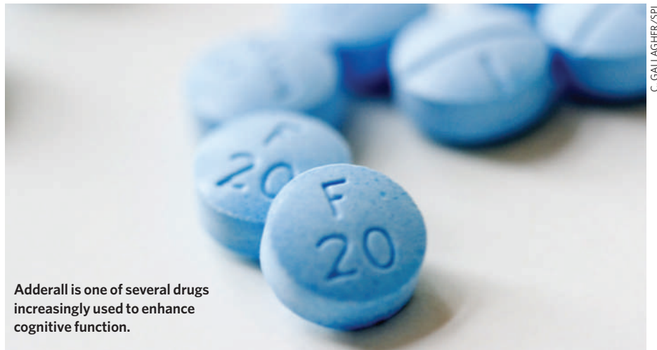
Adderall is one of several drugs increasingly used to enhance cognitive function.

Many of the medications used to treat psychiatric and neurological conditions also improve the performance of the healthy. The drugs most commonly used for cognitive enhancement at present are stimulants, namely Ritalin (methylphenidate) and Adderall (mixed amphetamine salts), and are prescribed mainly for the treatment of attention deficit hyperactivity disorder (ADHD). Because of their effects on the catecholamine system, these drugs increase executive functions in patients and most healthy normal people, improving their abilities to focus their attention, manipulate information in working memory and flexibly control their responses 3 . These drugs are widely used therapeutically. With rates of ADHD in the range of 4–7% among US college students using DSM criteria 4 , and stimulant medication the standard therapy, there are plenty of these drugs on